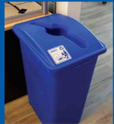
Multiple lids available