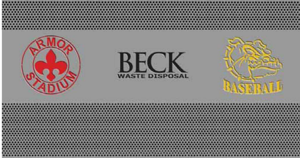
Step 1: Digital Stadium Receptacle In Flat View