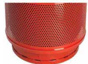
Protective coated based included