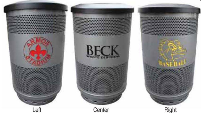
Left Center Right