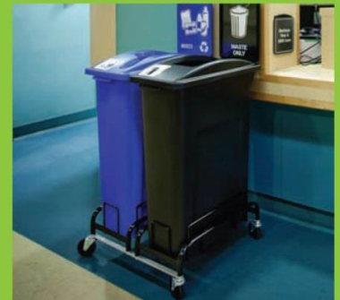
Optional Wheel Dollies