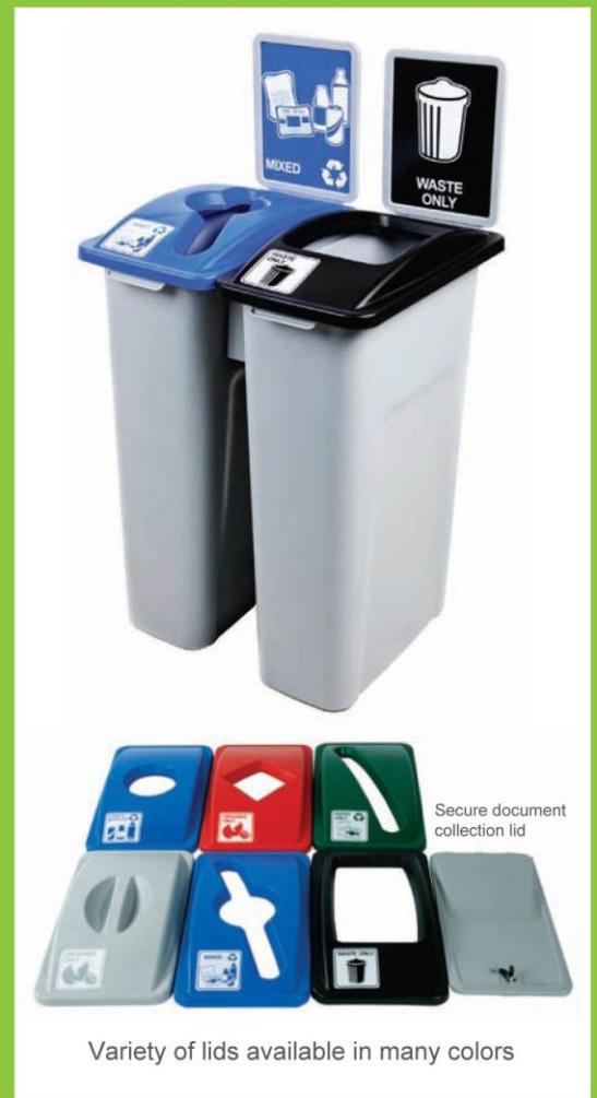
Variety of lids available in many colors