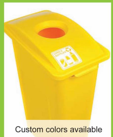
Custom colors available