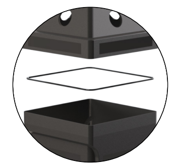
Wire insert holds bag in place