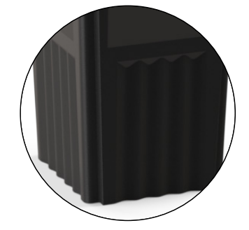
Ribbed construction for added strength