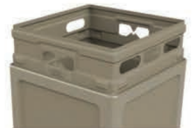
Patented Grab Bag™

Square waste container has a sleek and contemporary style with a snap lid closure and patented Grab Bag™ system to secure trash bag in place for a cleaner appearance. These heavy-duty waste containers are designed to withstand the harshest environments! Receptacle is perfect for indoor or outdoor use.