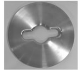
Recycling Lid for the #782729