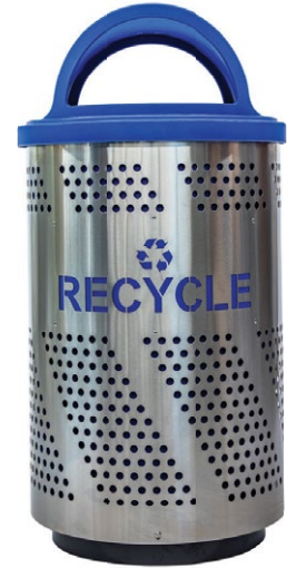
ARENA-X51 T R SS/RBL

The ARENA 51 Series receptacles are ready to provide facilities with a stellar solution for the collection of waste and recycling. Designed for indoor or outdoor use, the ARENA 51 provides customers with an attractive, completely customizable receptacle that ensures a perfect fit for any facility; custom colors, custom logos or both - the ARENA 51 gets the job done!