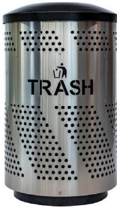
ARENA-51 T SS/BLK