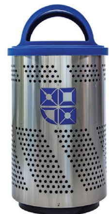
Custom logos available!