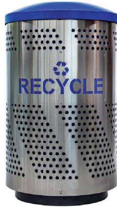
ARENA-51 R SS/RBL