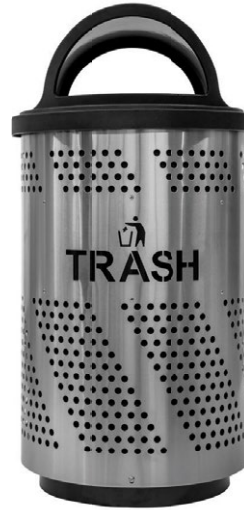
ARENA-X51 T SS/BLK