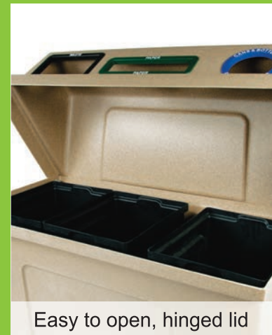
Easy to open, hinged lid