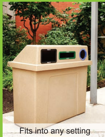
Fits into any setting