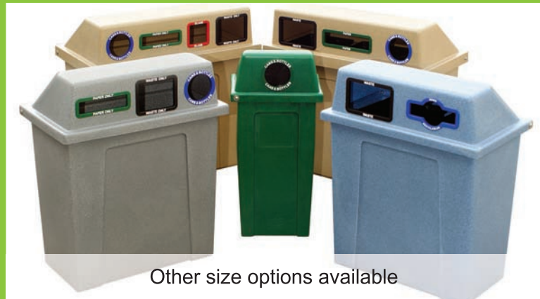
Other size options available